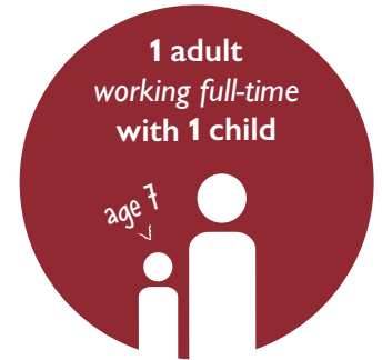
Single parent household $33.95/hr