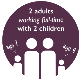
Two adults/two children household $25.91/hr

To better reflect the diversity of households, in 2025 we did the calculations for three household types.