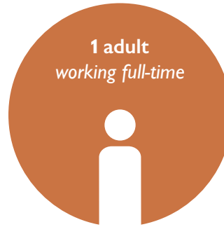
Single person household $31.22/hr